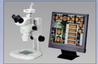
With Digital Sight series camera for microscopes