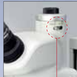
Optical path switching lever

The SMZ745T incorporates an optical path switching lever that enables easy switchover between eyepiece and camera. Nikon Digital Sight series camera can be attached.